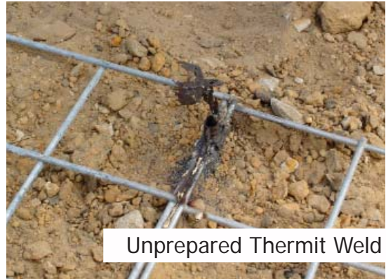
Unprepared Thermit Weld

Note: Information and features on the Denso products can be found at www.densona.com .